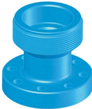
Quick Union Flange